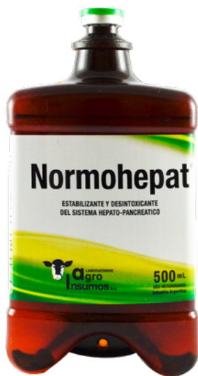
PRESENTATION Bottle of 500 ml

In some countries Normohepat is called Complhepat