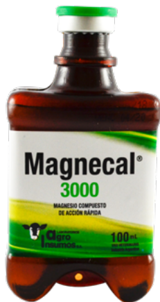
PRESENTATION Bottle of 100 ml