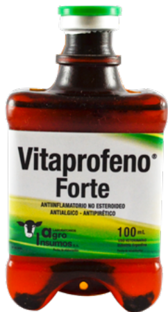
PRESENTATION Bottle of 100 ml

NON-STEROID ANTI-INFLAMMATORY. ANALGESIC-ANTIPYRETIC