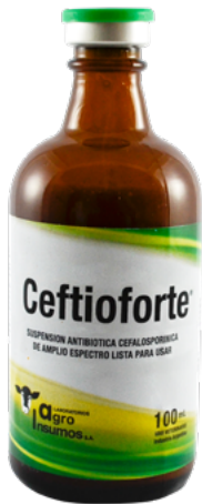
PRESENTATION Bottle of 100 ml

SUSPENSION OF CEPHALOSPORIN. BROAD SPECTRUM ANTIBIOTIC - READY TO USE